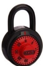
ABUS P/LOCK 78KC/50 (507-KEY) RED DIAL