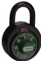
ABUS P/LOCK 78KC/50 (509-KEY) GRN DIAL

Master override key to suit: 411, 501, 507 & 509