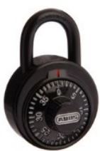
ABUS P/LOCK 78KC/50 (501-KEY) BLK DIAL